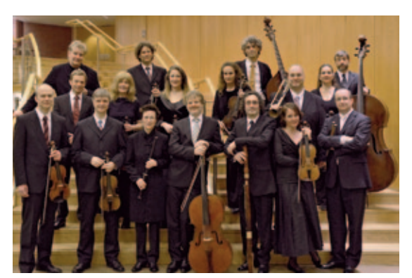
Concerto Köln (orchestra)