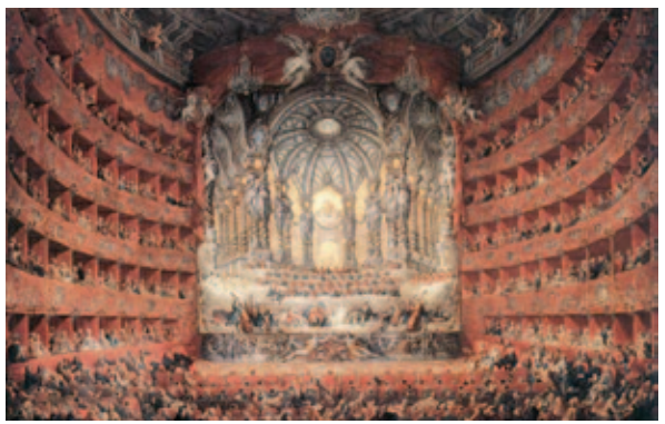
Teatro Argentina Roma