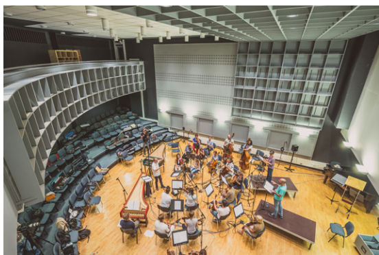
Capella Cracoviensis (orchestra)